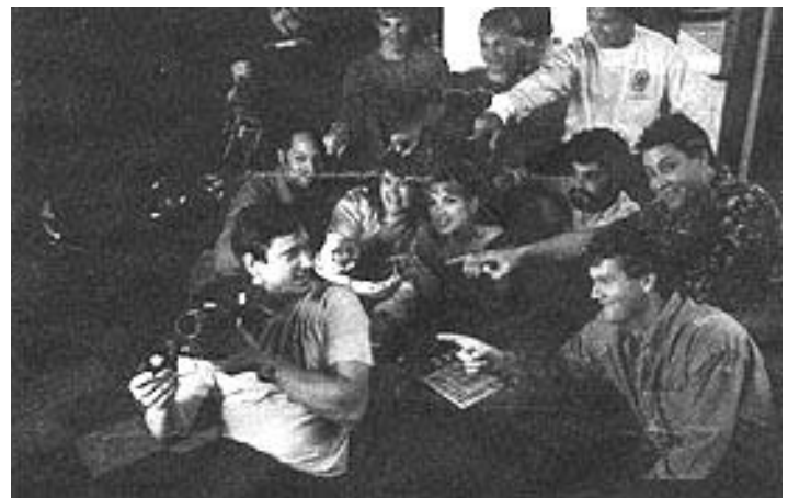
On location at The Wonder Bar

"Scene 10, roll one, take one," Bickernicks announces. The sound of film clattering along the camera's sprockets is Chase's cue. Hearing it, she clacks the arm down.