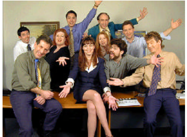
Principle cast goes "TA-DA!"