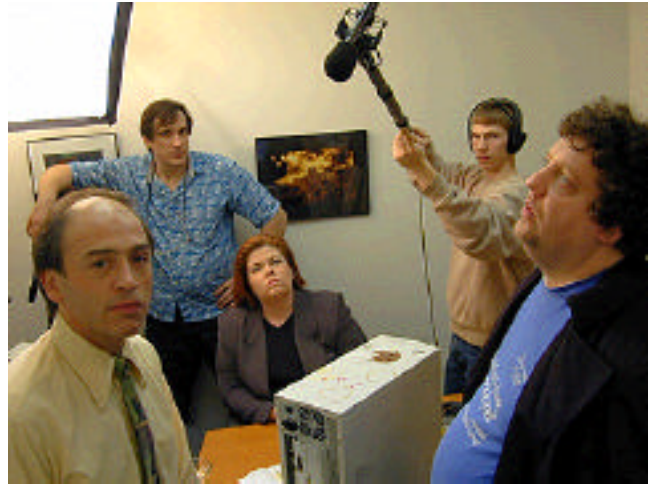
Cast and crew ponder fora moment during production.

The first feature length project written and directed by Eric Bickernicks, " alt.sex " is an Internet experience in every sense of the word. Not only does much of the action take place on the Internet, the production was created almost exclusively via the Internet. The original casting call was done online and the initial interviews were done through e-mail. The Super 16mm camera used to shoot the film was purchased online through E-bay, and the first 20 rolls of film were found on the usenet newsgroup alt.rec.movies.cinematography . Most of the music used in the film was found online through music websites such as mp3.com and IUMA.com . With a fast Internet connection, Eric was able to screen hundreds of potential artists and songs. He then contacted the artists online to secure permission to use their music.